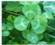
St. Patrick's Analogy

St. Patrick, the evangelist to Ireland, tried to teach about the Trinity by showing the shamrock, a three leaf clover, to the ancient residents of the island [Ireland]. The Trinity is composed of three persons (the 3 leaves) who are in nature one being (the shamrock itself). Each has a distinct function in relation to humanity.