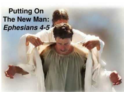
Putting On The New Man: Ephesians 4-5

Paul is very specific on why pastors and teachers are a gift to the church. When we are all doing what we're supposed to be doing, we are building one another up and we're stabilizing ourselves against crazy winds of doctrine that come along and lead people astray. This is why I stay in the Bible and don't get up here and do book studies. That way you'll each know what the Bible says. Paul then continues.