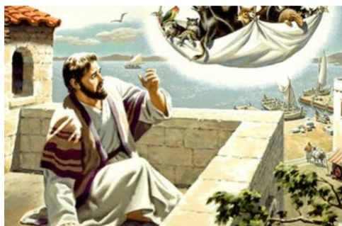
Acts 10 ~ Peter's Vision

9 The next day, as they went on their journey and drew near the city, Peter went up on the housetop to pray, about the sixth hour. 10 Then he became very hungry and wanted to eat; but while they made ready, he fell into a trance 11 and saw heaven opened and an object like a great sheet bound at the four corners, descending to him and let down to the earth. 12 In it were all kinds of four-footed animals of the earth, wild beasts, creeping things, and birds of the air. 13 And a voice came to him, “Rise, Peter; kill and eat.”