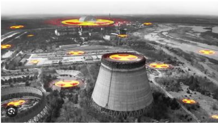
The Chernobyl Disaster - WorldAtlas

Images may be subject to copyright. Learn More