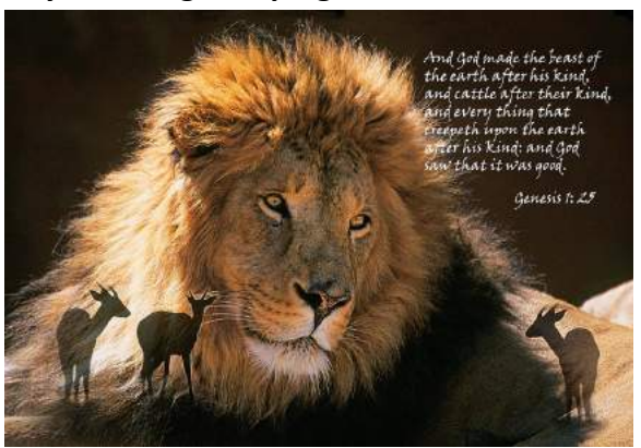
Day 6 - Living Creeping Creatures - Man and Woman

<sup>24</sup> And God said, Let the earth bring forth the living creature after his kind, cattle, and creeping thing, and beast of the earth after his kind: and it was so. <sup>25</sup> And God made the beast of the earth after his kind, and cattle after their kind, and everything that creepeth upon the earth after his kind: and God saw that it was good. (Genesis 1:24-25, KJV).