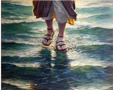
JESUS WALKS ON THE WATER © Sept 8, 2019

22 Immediately he made the disciples get into the boat and go before him to the other side, while he dismissed the crowds. 23 And after he had dismissed the crowds, he went up on the mountain by himself to pray . When evening came, he was there alone , 24 but the boat by this time was a long way from the land, beaten by the waves, for the wind was against them . 25 And in the fourth watch of the night he came to them, walking on the sea. 26 But when the disciples saw him walking on the sea, they were terrified , and said, “It is a ghost!” and they cried out in fear . 27 But immediately Jesus spoke to them, saying, “ Take heart; it is I. Do not be afraid. ”